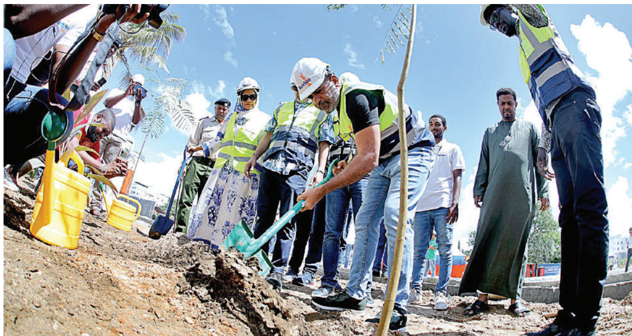
Mombasa Governor, Abdulswamad Nassir, plants a tree at Buxton to mark the beginning of handing over of 584 Phase One Units to buyers.

veloping the Sh13 billion Starehe Point, affordable housing project in Nairobi through a partnership with the National Govern-