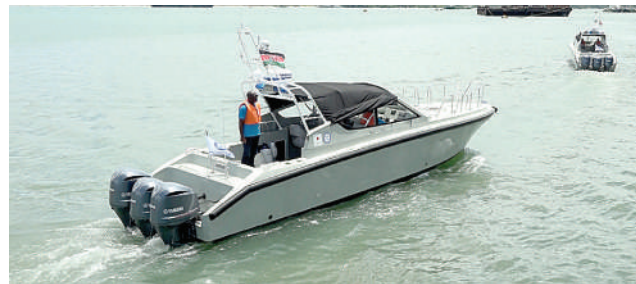
One of the boat doing some patrols after they were officially unveiled by the Deputy President Rigathi Gachagua in Mombasa.