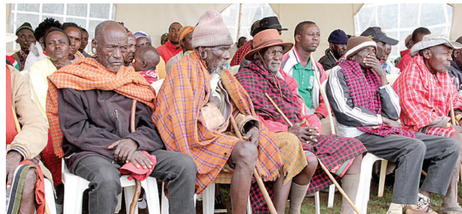
A section of the Il Ngwe’si community members during an annual meeting in Lukosero, Laikipia North. The community benefited from Sh36 million carbon credit money, thanks to their conservation effort of the Mukogodo forest.