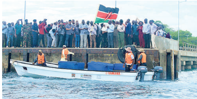
Deputy President Rigathi Gachagua when he flagged off the handing over of the modern fully fitted fishing boats to fisher folk of Shimoni.

Deputy President Rigathi Gachagua handed over the modern fully fitted fishing boats to fisher folk of Shimoni, Mkwiro and Kibuyuni Beach Management Units